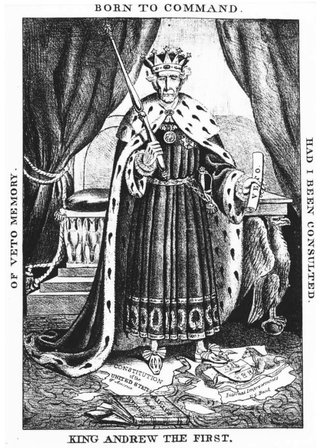
King Andrew the First , Unknown Artist, c. 1833

Questions 27-30 refer to the 1833 image below.