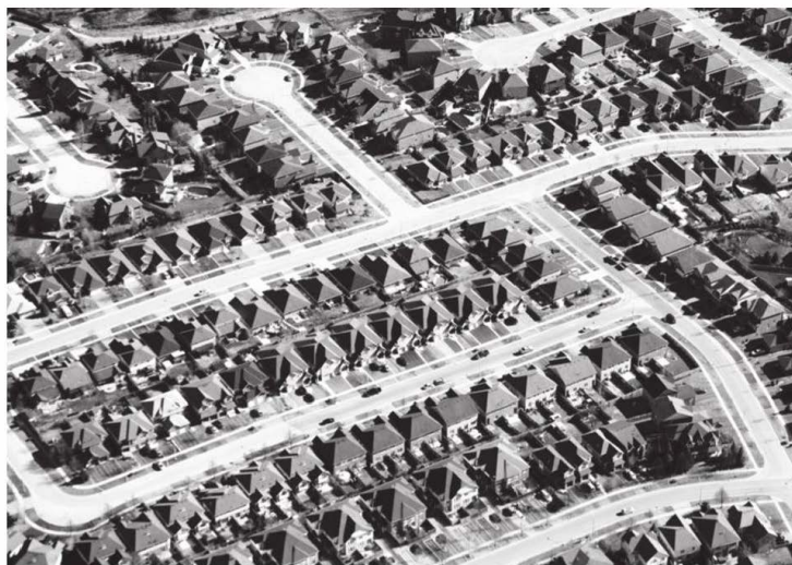
Levittown, Long Island, New York, c. 1948.