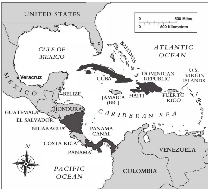
U.S. INTERVENTION IN THE CARIBBEAN, 1898 TO 1917

Conciliation Treaties Wilson's commitment to the ideals of democracy and peace was fully shared by his famous secretary of state, William Jennings Bryan. Bryan's pet project was to negotiate treaties in which nations pledged to (1) submit disputes to international commissions and (2) observe a one-year cooling-off period before taking military action. Bryan arranged, with Wilson's approval, 30 such conciliation treaties.