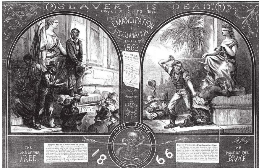
Source: Thomas Nast, “Slavery is Dead(?)” Harper’s Weekly , 1867. Library of Congress

Question 4 is based on the following cartoon.