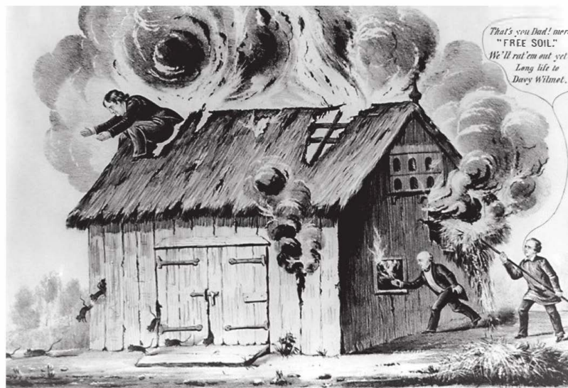
SMOKING HIM OUT.

Question 1 is based on the following cartoon.