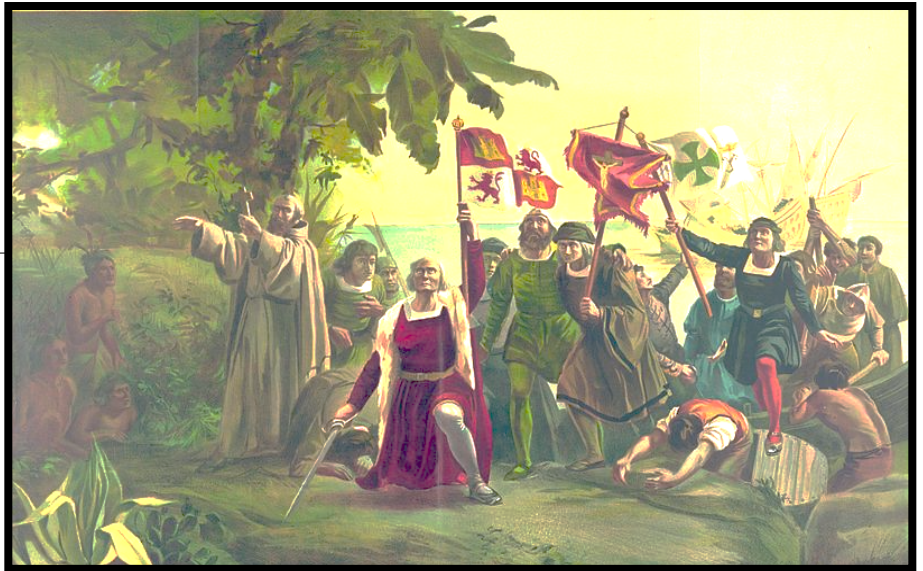
First landing of Columbus on the shores of the New World, at San Salvador, W.I., Oct. 12th 1492 , Dióscoro Teófilo Puebla Tolín