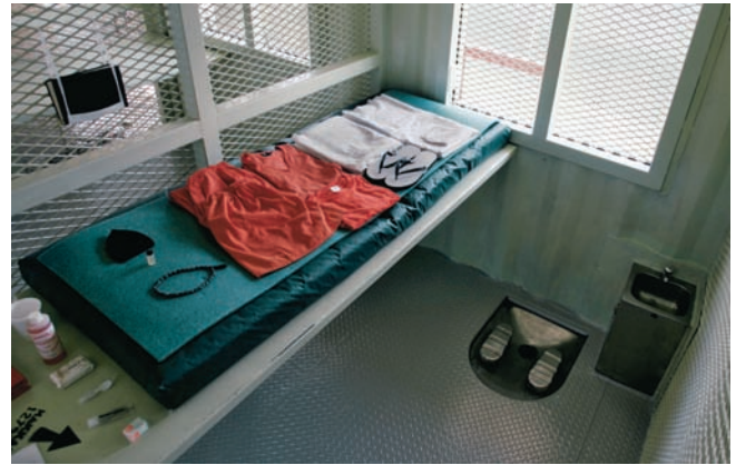
Inside a cell at the terrorist prison in Guantanamo, where Muslim inmates receive a copy of the Koran, a chess set, and an arrow pointing toward Mecca.

The biggest legal issue created by this country's war on terrorism is whether the people we capture can be held by our government without giving them access to the courts. The traditional view, first announced during World War II, was that spies sent to