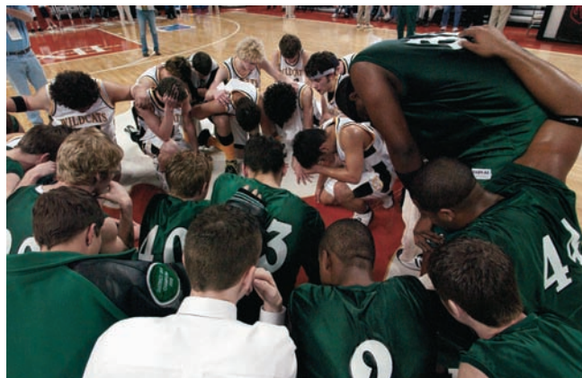
Two opposing high school basketball teams pray together after a game.

Unfortunately some conflicts between religious belief and public policy are even more difficult to settle. What if you believe on religious grounds that war is immoral? The draft laws have always exempted a conscientious objector from military duty, and the Court has upheld such exemptions. But the Court has gone further: it has said that people cannot be drafted even if they do not believe in a Supreme Being or belong to any religious tradition, so long as their “consciences, spurred by deeply held moral, ethical, or religious beliefs, would give them no rest or peace if they allowed themselves to become part of an instrument of war.” 44 Do exemptions on such grounds create an opportunity for some people to evade the