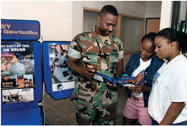
Students at a high school talk to a military recruiter.