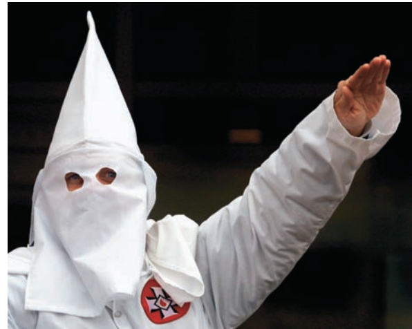
A Ku Klux Klan member uses his constitutional right to free speech to utter “white power” chants in Skokie, Illinois.

A beauty contest winner was awarded $14 million (later reduced on appeal) when she proved that Penthouse magazine had libeled her. The actress Carol Burnett collected a large sum from a libel suit brought against a gossip newspaper. But when Theodore Roosevelt sued a newspaper for falsely claiming that he was a drunk, the jury awarded him damages of only six cents. 17