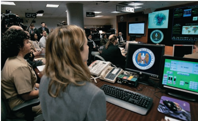
The Threat Operations Center at the National Security Agency in Fort Meade, Virginia.

when the Cleveland police broke into the home of Dollree Mapp in search of illegal drugs, and not finding them, arrested her for possessing some obscene pictures that they found there. The Court held that this was an unreasonable search and seizure because the police had not obtained a search warrant, though they had had ample time to do so. Furthermore, such illegally gathered evidence could not be used in the trial of Mapp. 71 Beginning with this case— Mapp v. Ohio —the Supreme Court required the use of the exclusionary rule as a way of enforcing a variety of constitutional guarantees.