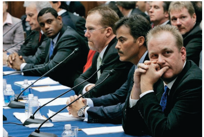
From right to left, Curt Schilling, Rafael Palmeiro, Mark McGwire, and Sammy Sosa testify at a congressional hearing about drug use in baseball.

Of late a movement has arisen to deregulate broadcasting, on the grounds that so many stations are now on the air that competition should be allowed to determine how each station defines and serves community needs. In this view citizens can choose what they want to hear or see without the government's shaping the content of each station's programming. For example, since the early 1980s a station can simply submit a postcard requesting that its license be renewed, a request automatically granted unless some group formally opposes the renewal. In that case the