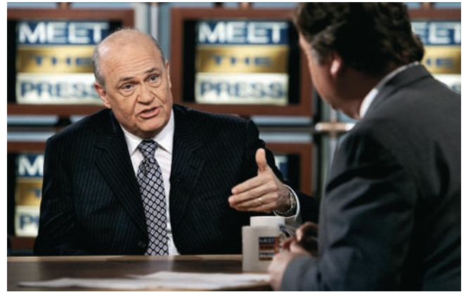
Fred Thompson on the TV show, Meet the Press .

Scorekeeper As scorekeepers the national media keep track of and help make political reputations, note who is being “mentioned” as a presidential candidate, and help decide who is winning and losing in Washington politics. When Jimmy Carter, a virtually unknown former governor of Georgia, was planning his campaign to get the Democratic nomination for president, he understood clearly the importance of being “mentioned.” So successful was he in cultivating members of the national press that, before the first primary election was held, he was the subject of more stories