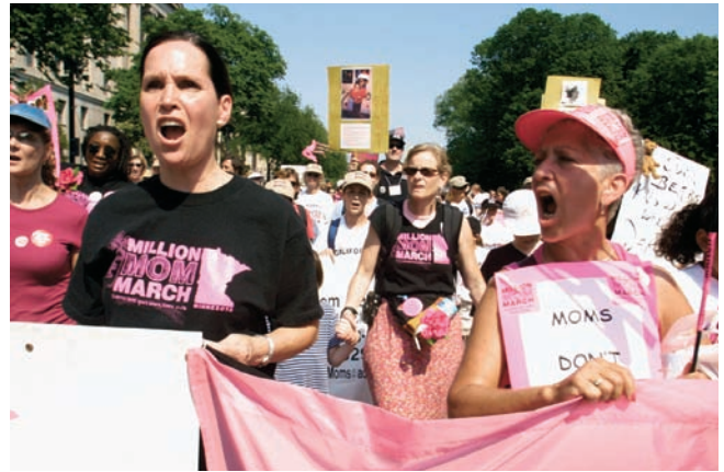
The Million Moms March in 2004 demanded a federal ban on assault weapons.

There have been several feminist social movements in this country's history—in the 1830s, in the 1890s, in