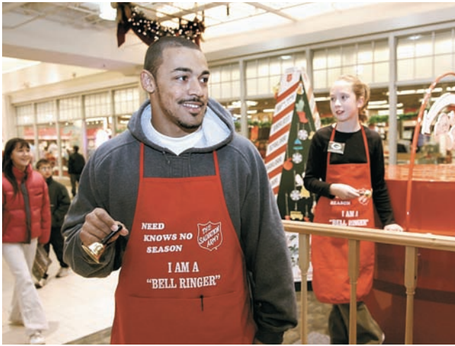
A Green Bay Packers linebacker solicits money for the Salvation Army.