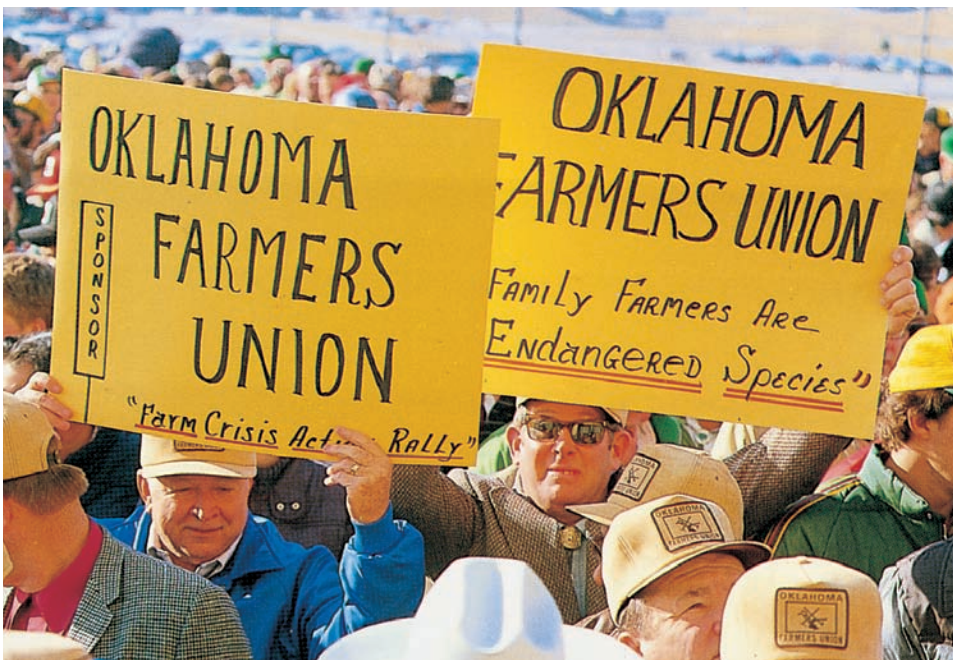
Farmers once had great influence in Congress and could get their way with a few telephone calls. Today they often must use mass protest methods.

Whenever American politics is described as having an upper-class bias, it is important to ask exactly what this bias is. Most of the major conflicts in American politics—over foreign policy, economic affairs, environmental protection, or equal rights for women—are conflicts within the upper middle class; they are conflicts, that is, among politically active elites. As we