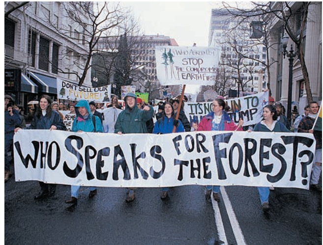
The greater the activity of government—for example, in regulating the timber industry—the greater the number of interest groups.

not emerge until 1910. Men and women worked in factories for decades before industrial unions were formed.