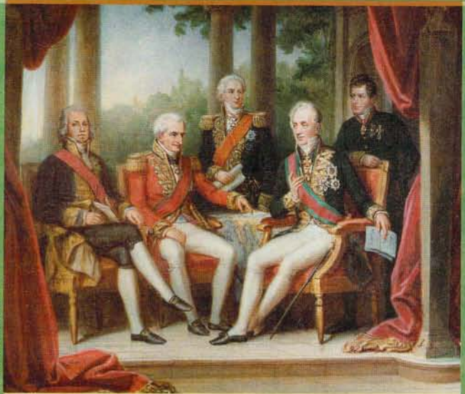
A gathering of statesmen at the Congress of Vienna