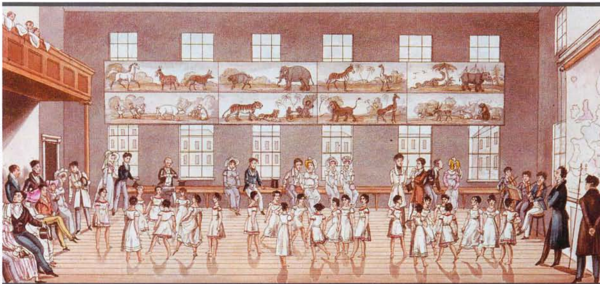
Children at New Lanark. Robert Owen created an early experiment in utopian socialism by establishing a model industrial community at New Lanark, Scotland. In this illustration, the children of factory workers are shown dancing the quadrille.

preaching the need for the liberation of women. Her Worker's Union , published in 1843, advocated the application of Fourier's ideas to reconstruct both family and work: