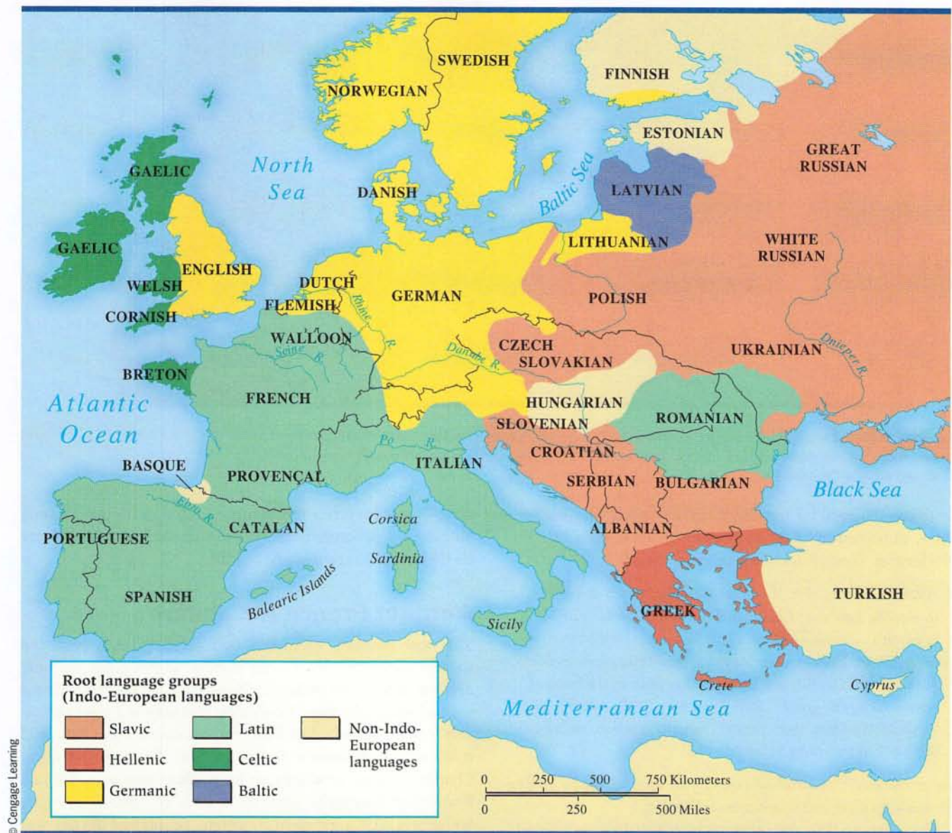
MAP 21.3 The Distribution of Languages in Nineteenth-Century Europe. Numerous languages were spoken in Europe. People who used the same language often had a shared history and culture, which laid the seeds for growing nationalism in the nineteenth century. Such nationalism eventually led to unification for Germany and Italy but spelled trouble for the polyglot Habsburg empire.

Q Look at the distribution of Germanic, Latin, and Slavic languages. What patterns emerge, and how can you explain them?