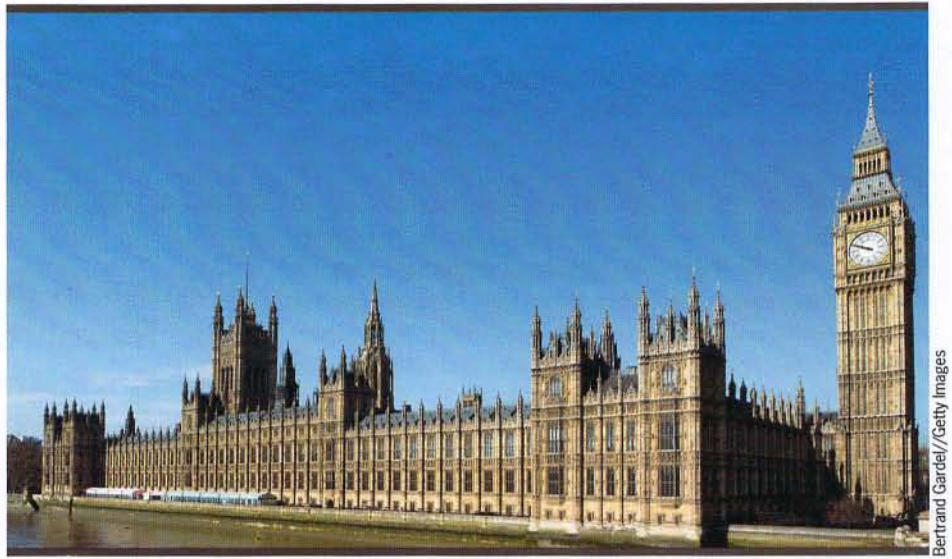
Neo-Gothic Revival: British Houses of Parliament. The Romantic movement of the first half of the nineteenth century led, among other things, to a revival of medieval Gothic architecture that left European cities bedecked with neo-Gothic buildings. After the Houses of Parliament in London burned down in 1834, they were replaced with new buildings of neo-Gothic design, as seen in this photograph.

To the Romantics, poetry ranked above all other literary forms because they believed it was the direct expression of one's soul. The Romantic poets were viewed as seers who could reveal the invisible world to others. Their incredible sense of drama made some of them the most colorful figures of their era, living intense but short lives. Percy Bysshe Shelley (1792–1822), expelled from school for advocating atheism, set out to reform the world. His Prometheus Unbound , completed in 1820, is a portrait of the revolt of human beings against the laws and customs that oppress them. He drowned in a storm in the Mediterranean. Lord Byron (1788–1824) dramatized himself as the melancholy Romantic hero that he had described in his work, Childe Harold's Pilgrimage . He participated in the movement for Greek independence and died in Greece fighting the Ottomans.