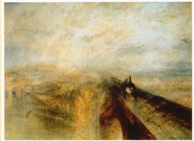
National Gallery, London / © Erich Lessing/Art Resource, NY