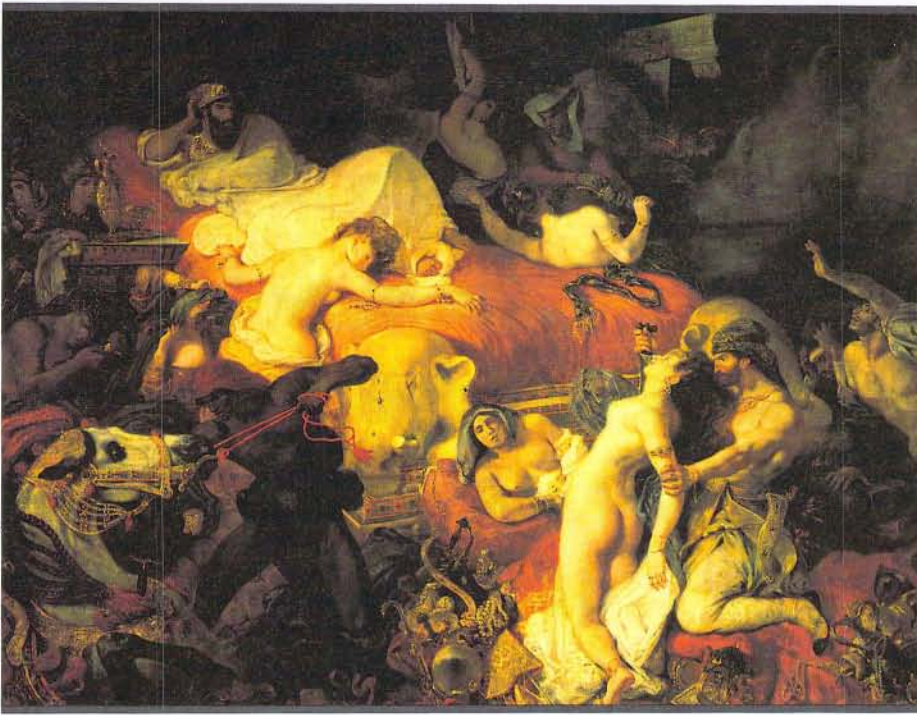
Eugène Delacroix, The Death of Sardanapalus . Delacroix's Death of Sardanapalus was based on Lord Byron's verse account of the dramatic last moments of the decadent Assyrian king. Besieged by enemy troops and with little hope of survival, Sardanapalus orders that his harem women and prized horses go to their death with him. At the right, a guard stabs one of the women as the king looks on.