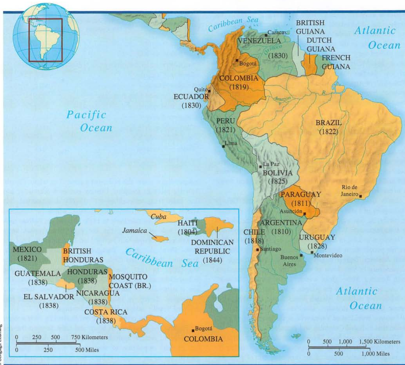
MAP 21.2 Latin America in the First Half of the Nineteenth Century. Latin American colonies took advantage of Spain's weakness during the Napoleonic wars to fight for independence, beginning with Argentina in 1810 and spreading throughout the region over the next decade with the help of leaders like Simón Bolívar and José de San Martín. The dates in parentheses show the years in which the countries received formal recognition.

Q How many South American countries are sources of rivers that feed the Amazon, and roughly what percentage of the continent is contained within the Amazon's watershed?