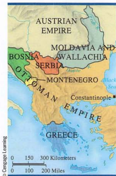
The Balkans by 1830

of Adrianople in 1829, which ended the Russian-Turkish war, the Russians received a protectorate over the two provinces. By the same treaty, the Ottoman Empire agreed to allow Russia, France, and Britain to decide the fate of Greece. In 1830, the three powers declared Greece an independent kingdom, and two years later, a new royal dynasty was established. The revolution had been successful only because the great powers themselves supported it. Until 1830, the Greek revolt was the only successful one in Europe; the conservative domination was still largely intact.