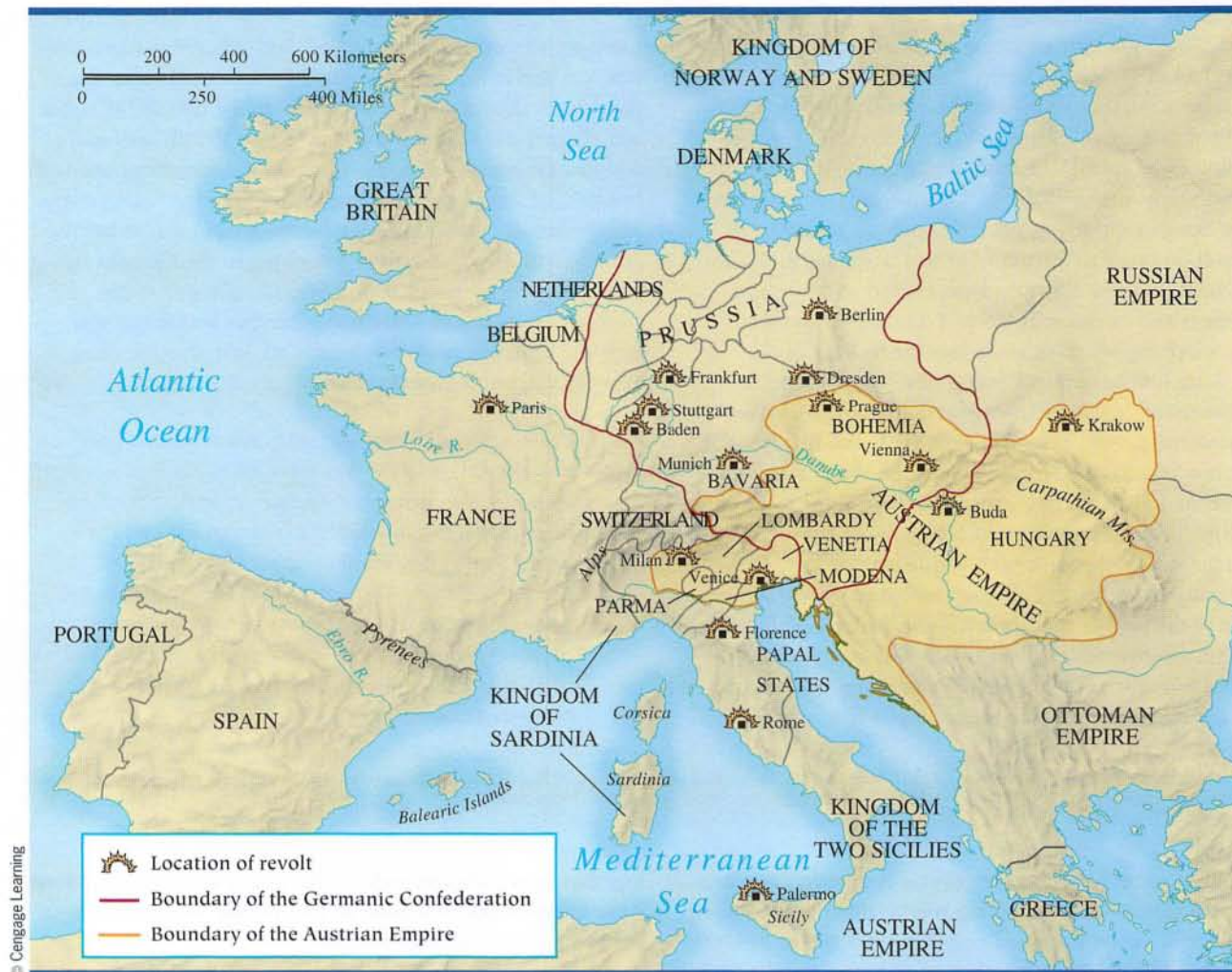
MAP 21.4 The Revolutions of 1848–1849. Beginning in Paris, revolutionary fervor fueled by liberalism and nationalism spread to the east and the south. After initial successes, the revolutionaries failed to maintain unity: propertied classes feared the working masses, and nationalists such as the Hungarians could not agree that all national groups deserved self-determination. The old order rallied its troops and prevailed.

Q Which regions saw a great deal of revolutionary activity in 1848–1849, and which did not?