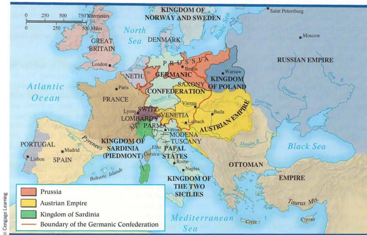
MAP 21.1 Europe After the Congress of Vienna, 1815. The Congress of Vienna imposed order on Europe based on the principles of monarchical government and a balance of power. Monarchs were restored in France, Spain, and other states recently under Napoleon's control, and much territory changed hands, often at the expense of the smaller, weaker states.

Q How did Europe's major powers manipulate territory to decrease the probability that France could again threaten the Continent's stability?